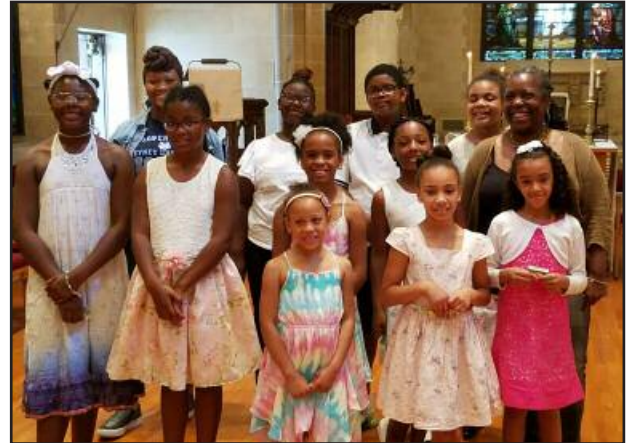
Choristers of Salem Baptist Church, Roslyn, at the St. Paul's Elkins Park, Juneteenth observance, 2019.